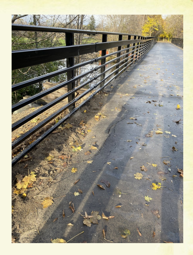
Tree Removal Projects by Karen Stearns

The Board has concentrated on removal of encroaching trees and dead trees on the FMHT in 2021. Smaller, encroaching trees along the Trail have been removed by The Stump Guy , a business in Crystal, over the nine miles from Riverdale to Luce Road. A new project to remove dead trees is underway from Sidney Road to Carlson Road in Montcalm County.